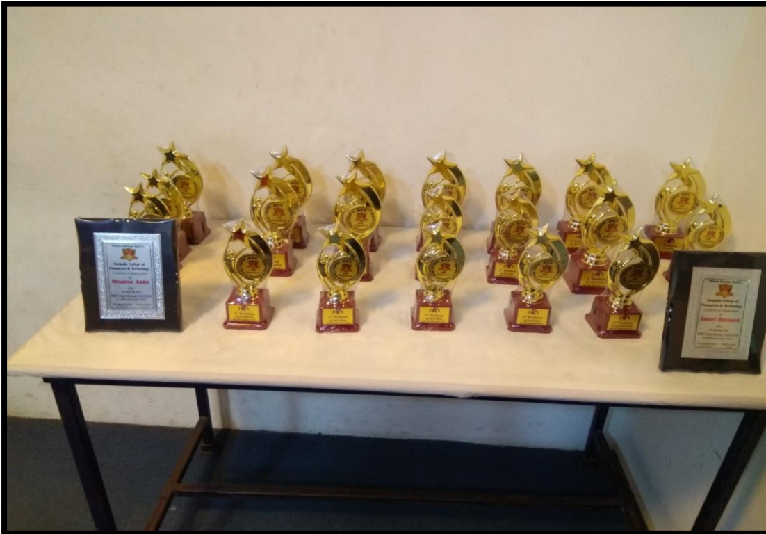
TROPHIES AWARDED TO THE WINNERS