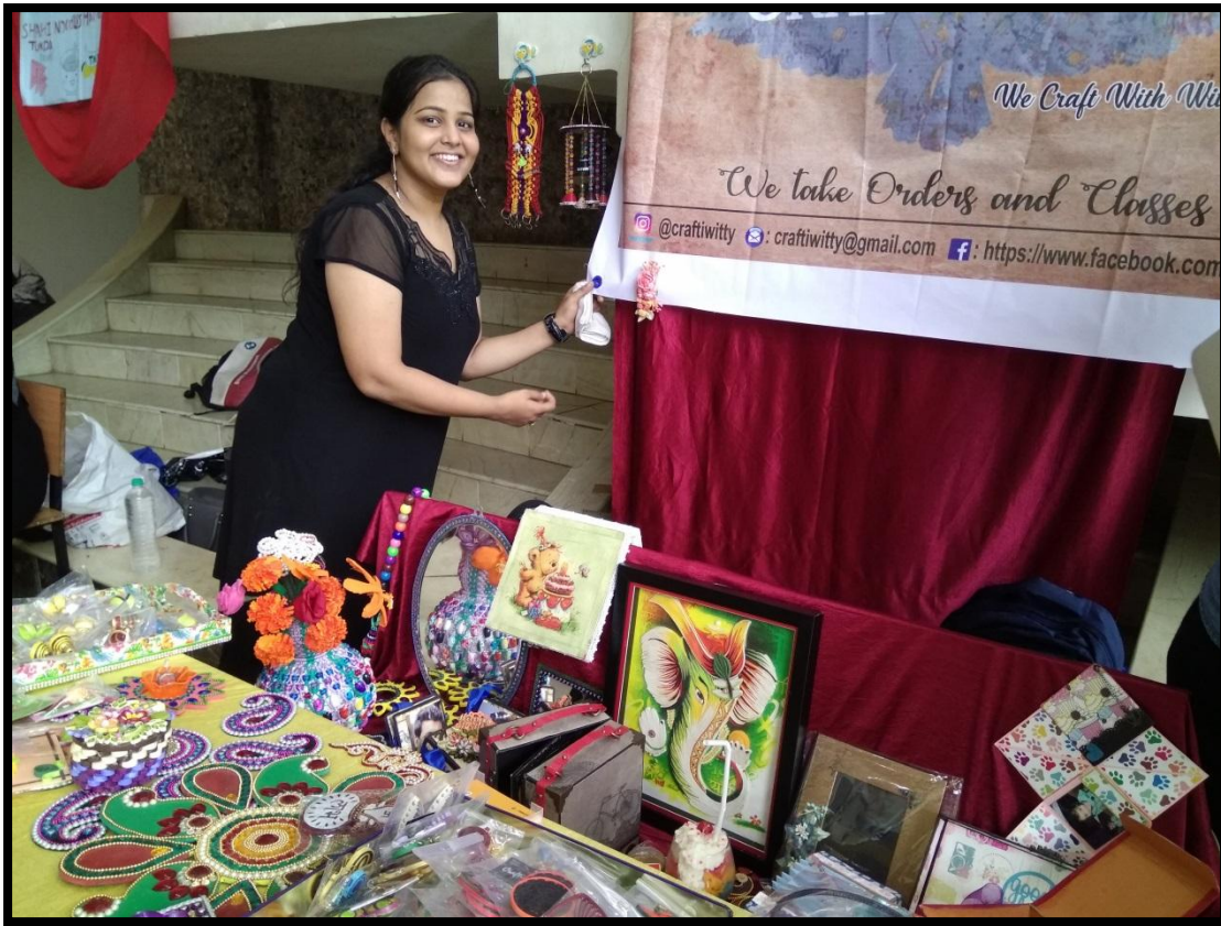
ONE OF THE ENTREPRENEURIAL STALL WITH OUTSTANDING PERFORMANCE